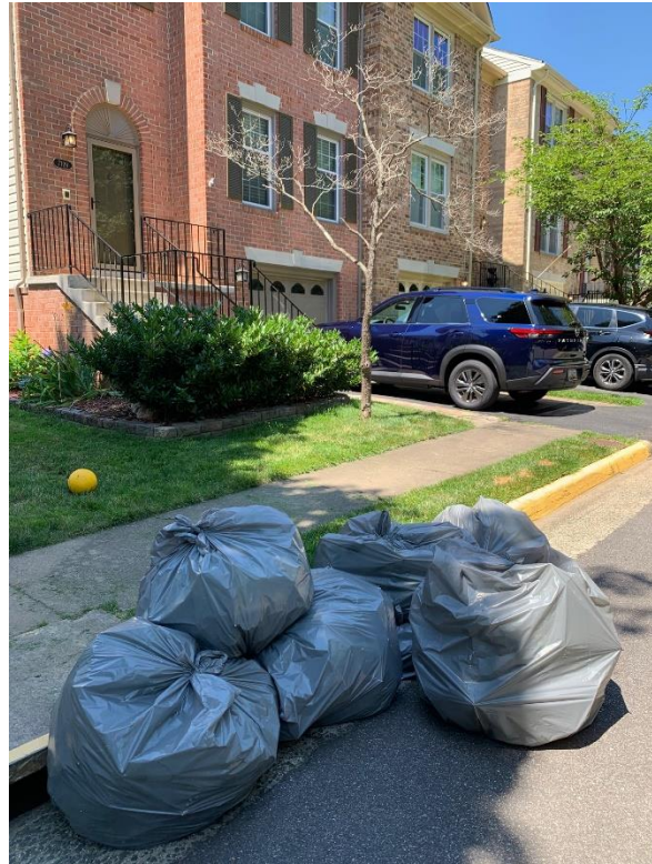
Invasives Hauled from Restoration Site

Quill Camp: On June 30 th from 10:30 to 12:30, a group of volunteers from CareFirst will be volunteering at Daniels Run Elementary school to remove invasive plant species for the outdoor classroom areas our sister group, Lands and Waters, has constructed over the years. We need a half dozen leaders to help guide the volunteers. A group of George Mason University students were looking to participate, but had to cancel for lack of registrants.